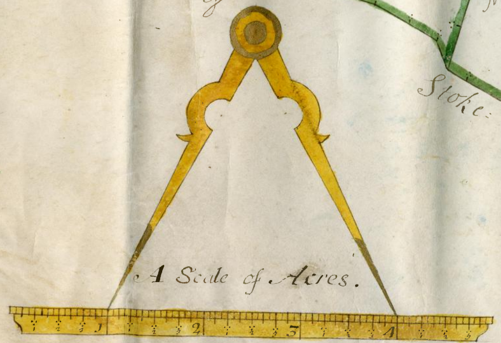
A Scale of Acres.